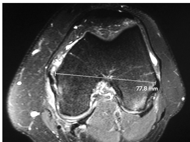
Fig. 2 Measurement of the interepicondylar distance in the axial cut of MRI exam

Qualitative variables were described as relative and absolute frequencies, while quantitative variables were described as means, standard deviations, medians, minimum and