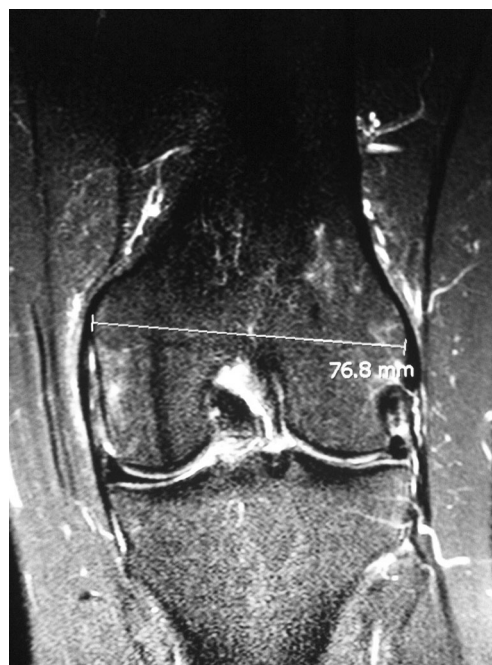
Fig. 3 Measurement of the interepicondylar distance in coronal cut of MRI exam

(<3 mm indicating trochlear dysplasia [3, 5, 16]); ventral trochlear prominence, measured in the sagittal section (>6.9 mm indicating trochlear dysplasia [16]); trochlear groove angle, measured in the axial section, 3 cm above the joint surface (>150° indicating trochlear dysplasia [2, 3, 5]); inclination of the lateral facet, corresponding to the angle of inclination of the lateral facet relative to the coronal plane, tangent to the posterior region of the femoral condyles (<11° indicating trochlear dysplasia [3, 5]) - Ratio of the trochlear facets, medial to lateral, measured in the axial section 3 cm above the joint surface (<0.4 indicating trochlear dysplasia [3, 5, 16])