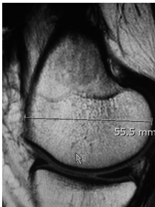
Fig. 1 Measurement of the anteroposterior distance in the medial condyle in the sagittal cut of MRI exam